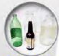
Glass Bottles (all colors)