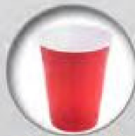
Plastic Cups Lids / Straws go in trash