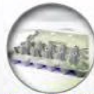
Paper Egg Carton