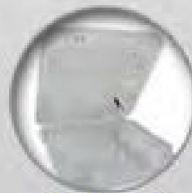
Plastic Food Clam Shells