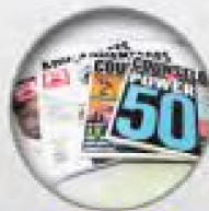
Magazines / Catalogs