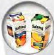
Paper Milk / Juice Cartons