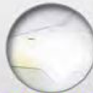
Office Paper & Folders