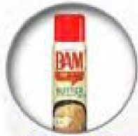
Aerosol Cans (Food Grade)

All Containers Should be Empty And Clean