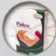
Cereal / Shoe Box