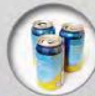
Metal & Aluminum Cans