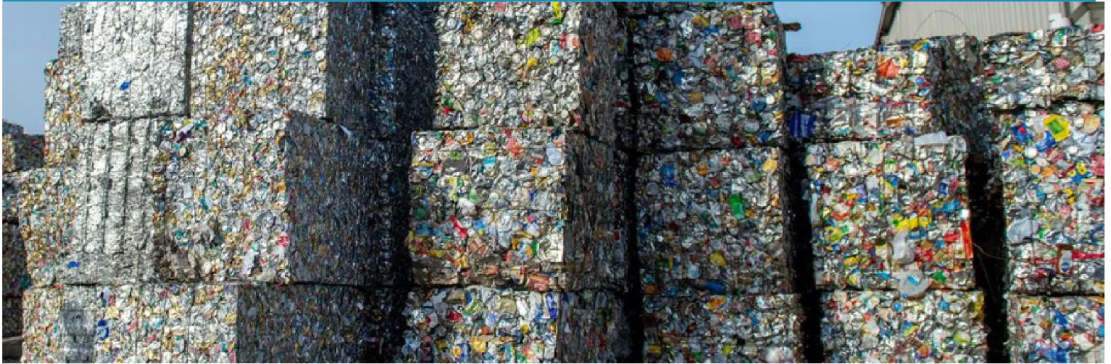
Single Stream recycling baled and ready for shipment Willimantic Waste/Casella Facility