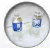
Plastic Bottles (Water, Soda)